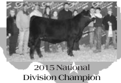
2015 National Division Champion