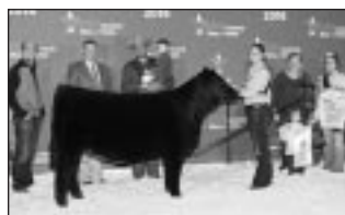
Southern Jewel Cattle Co. exhibited the International Reserve Grand Champion Simmental Female.