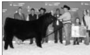
Red River Farms exhibited the International Reserve Grand Champion Simmental Bull.