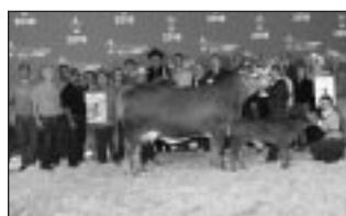
RND Cattle exhibited the International Reserve Grand Champion Simbrah Female.