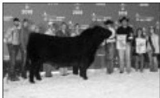
Sublette Cattle Co. exhibited the International Grand Champion Simmental Bull.