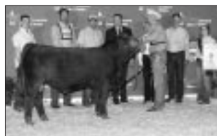
Smith Genetics and Reavis Farms exhibited the International Reserve Grand Champion Simbrah Bull.